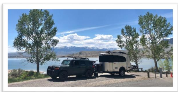
Buffalo Bill State Park in Cody, Wyoming