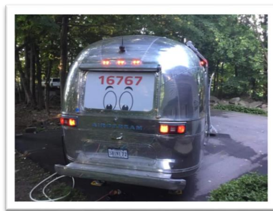
Scott & Elaine Myers decided their Shiny 72 needed some rear personality!